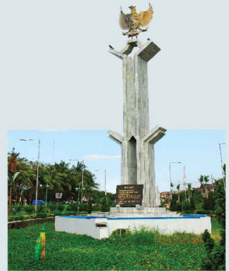
Monumen Pancasila, Sidoarjo ▶