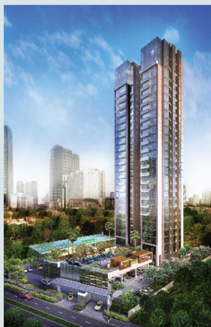
.20 | 20 Menteng Jakarta ▶