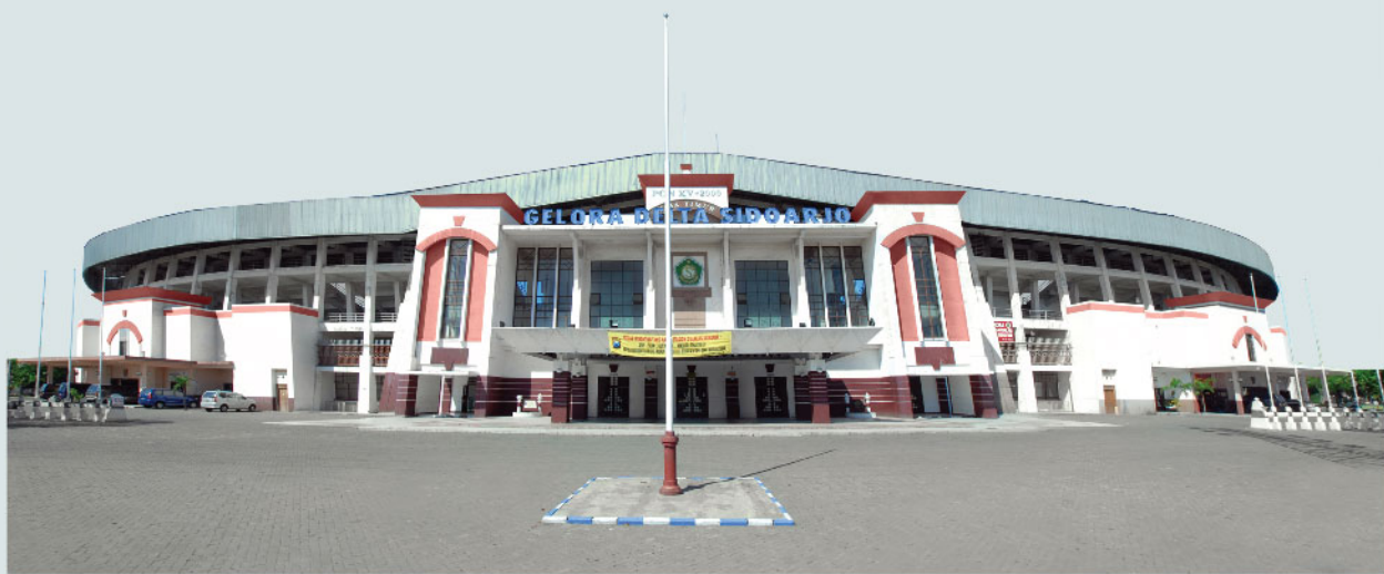
► Gelora Delta Sidoarjo.