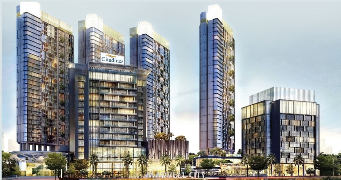
◀ Marvell City Superblock Surabaya. - Apartment - Mall - Hotel - School